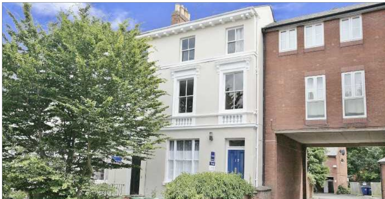
Flat 3 12 Calthorpe Road Banbury, Oxfordshire, OX16 5HS