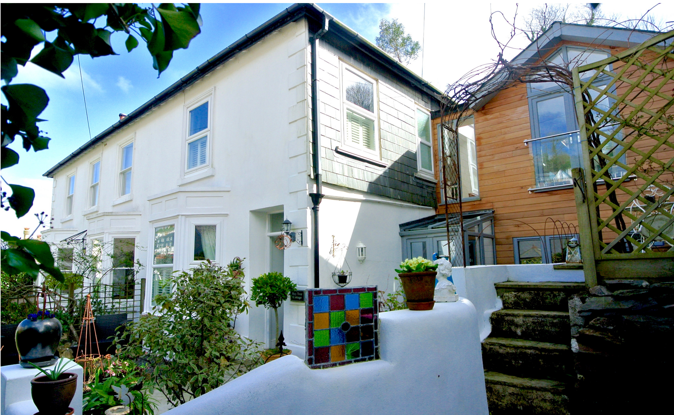
Bay Tree Cottage, 143 Victoria Road, Dartmouth, TQ6 9EF