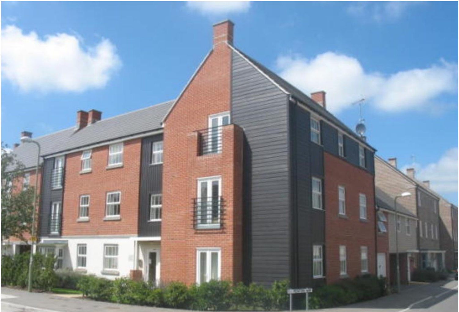
7 Penton Way, Marnel Park, Basingstoke, Hampshire, RG24 9RT £875 pcm + fees

TOTAL APPROX. FLOOR AREA 78.8 SQ.M. (848 SQ.FT.) Whilst every attempt has been made to ensure the accuracy of the floor plan contained here, measurements of doors, windows, rooms and any other items are approximate and no responsibility is taken for any error, omission, or mis-statement. This plan is for illustrative purposes only and should be used as such by any prospective purchaser. The services, systems and appliances shown have not been tested and no guarantee as to their operability or efficiency can be given Made with Metropix ©2009