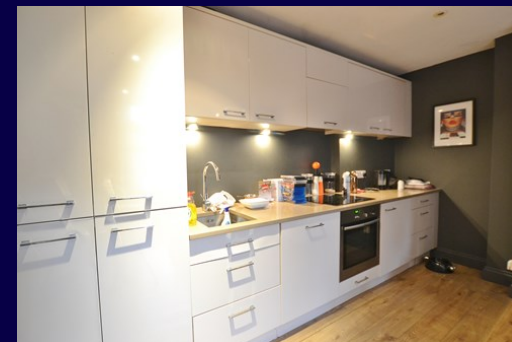
Brunswick Place HOVE £1,095 pcm