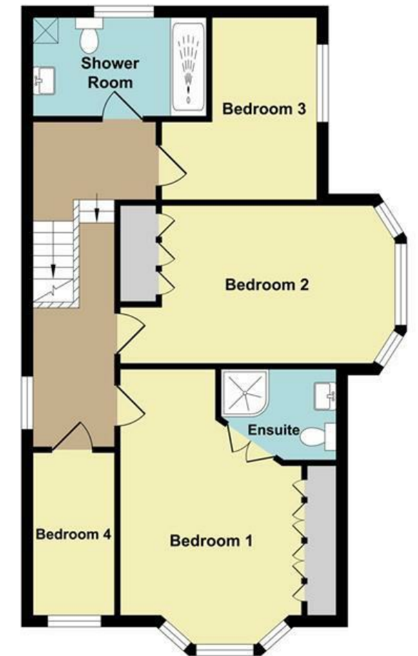
First Floor Area 56.51 Sq.M. (608 Sq.Ft.)

Total Approx. Floor Area 129.84 Sq.M. (1398 Sq.Ft.) Measurements are approximate. Not to scale. Illustrative purposes only.