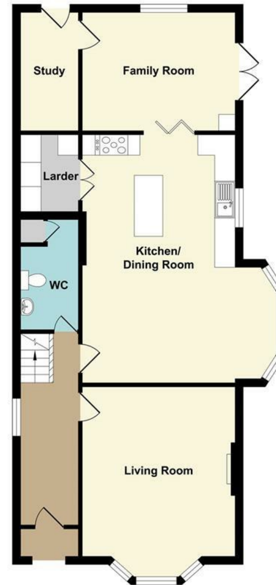
Ground Floor Area 73.33 Sq.M. (789 Sq.Ft.)

VIEWING: BY APPOINTMENT PLEASE THROUGH THE OWNERS AGENTS CATLING & CO. 24 HOUR ANSWER PHONE SERVICE. 01372 471111