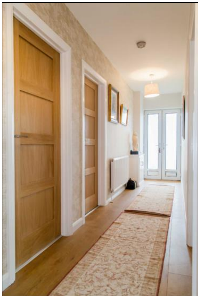
ENTRANCE HALL With feature wall decor.