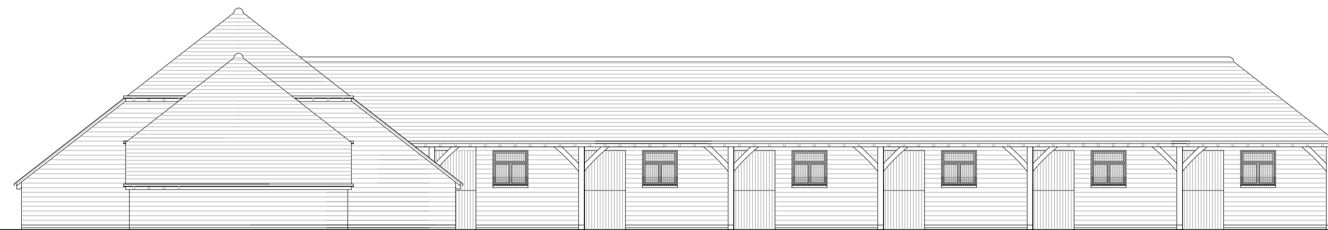
W E S T E L E V A T I O N