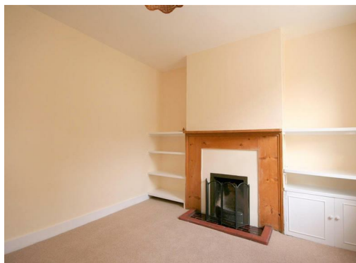
Living Room 11'3" x 10'0"